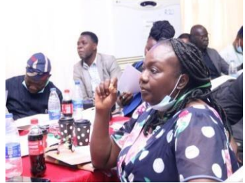
Scenes from the facilitated discussion sessions